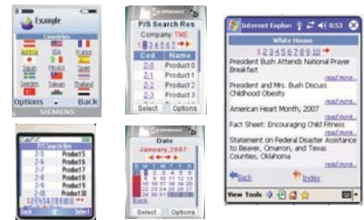
Web interfaces are adapted at runtime depending on the delivery context

Device Independent Standards Based Open Source